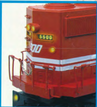
WORKING LIGHTS IN BACK