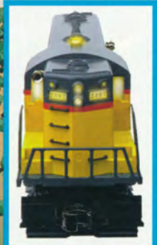
WORKING HEADLIGHT AND CAB LIGHT

And it doesn't stop there. We've added even more features for this special Heritage offering.