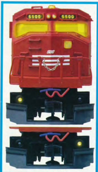
OSCILLATING DITCH LIGHTS