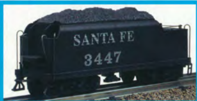
DETAILED TENDER WITH METAL RAILS AND LADDERS