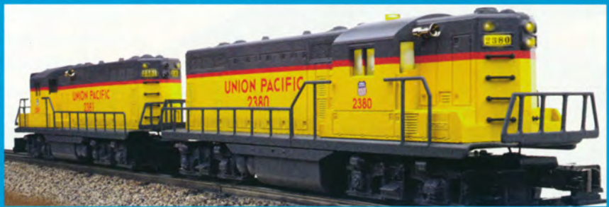
EXTRA POWER FOR THOSE UPHILL GRADES