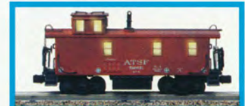
DETAILED CABOOSE WITH METAL RAILS AND LADDERS