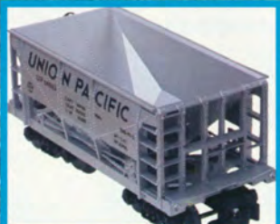
DETAILED, DIE-CAST ORE CARS