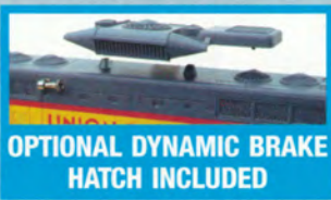
OPTIONAL DYNAMIC BRAKE HATCH INCLUDED