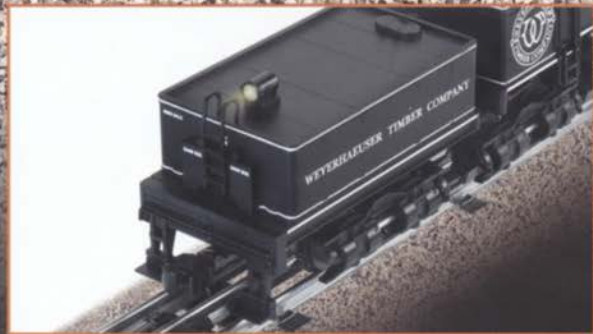
Authentic tender detailing with operating back-up light and ElectroCoupler™