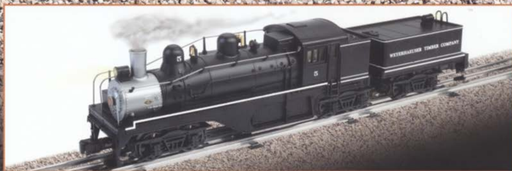
Left view of the Weyerhaeuser showing the opposite side of the unique Shay locomotives