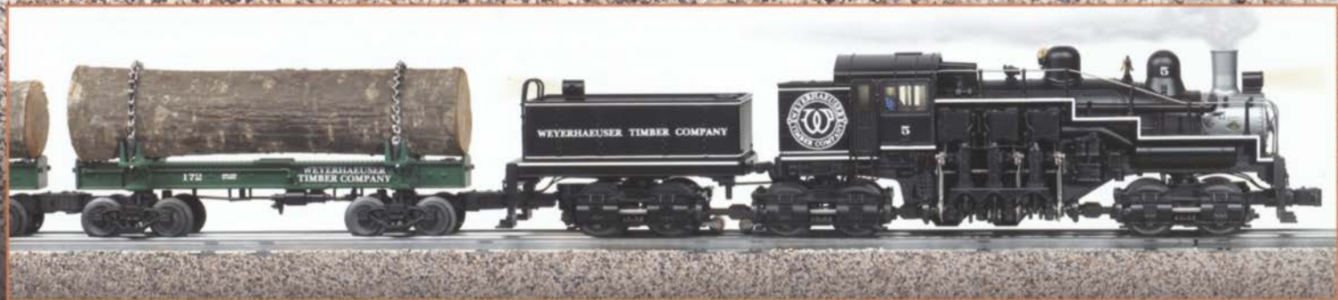
6-38057 Weyerhaeuser Shay with matching skeleton log cars